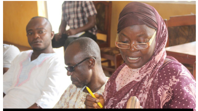
Kono Women's Network member close by him is the chairman for People With PWD attended the dialogue both representatives presented the acute shortage of water supply in their communities which is as a result of climate change. Moving forward all hand needs to be on board to mitigate it.