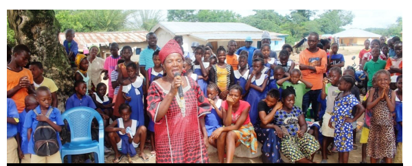
In Yardu community Kono district, the Mamie Queen after the drama performance expressed thanks and appreciation to AID/SL and UNDP for supporting such an educative exercise; "we are grateful for that." She encouraged all community members present to explain the climate change and deforestation messages which affect our water services.