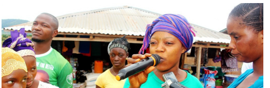
The young lady says "how can we stop deforestation in the communities when government gives licenses to people to cut our trees for timber. Please AID/SL and Partners, tell government to hands-off timber logging, its affect our environment and our future."