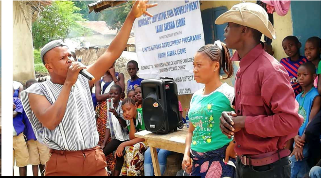
Theatre Drama performance in Yardu community in Gbense chiefdom, Kono disseminating key and interesting climate change messages caused by deforestation and mining to community