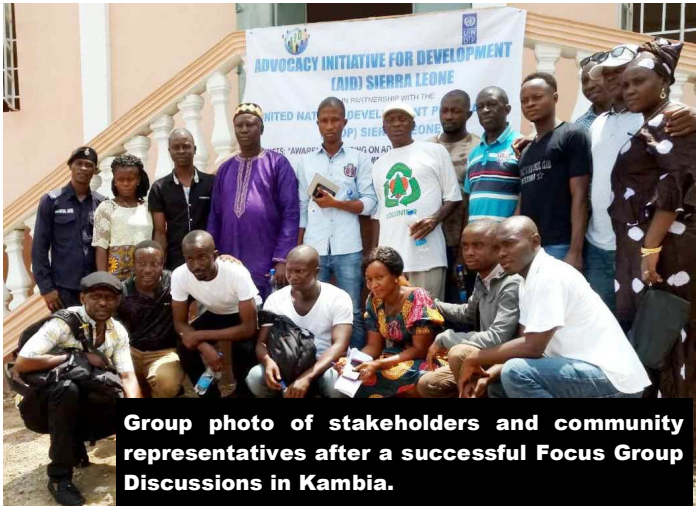
Group photo of stakeholders and community representatives after a successful Focus Group Discussions in Kambia.