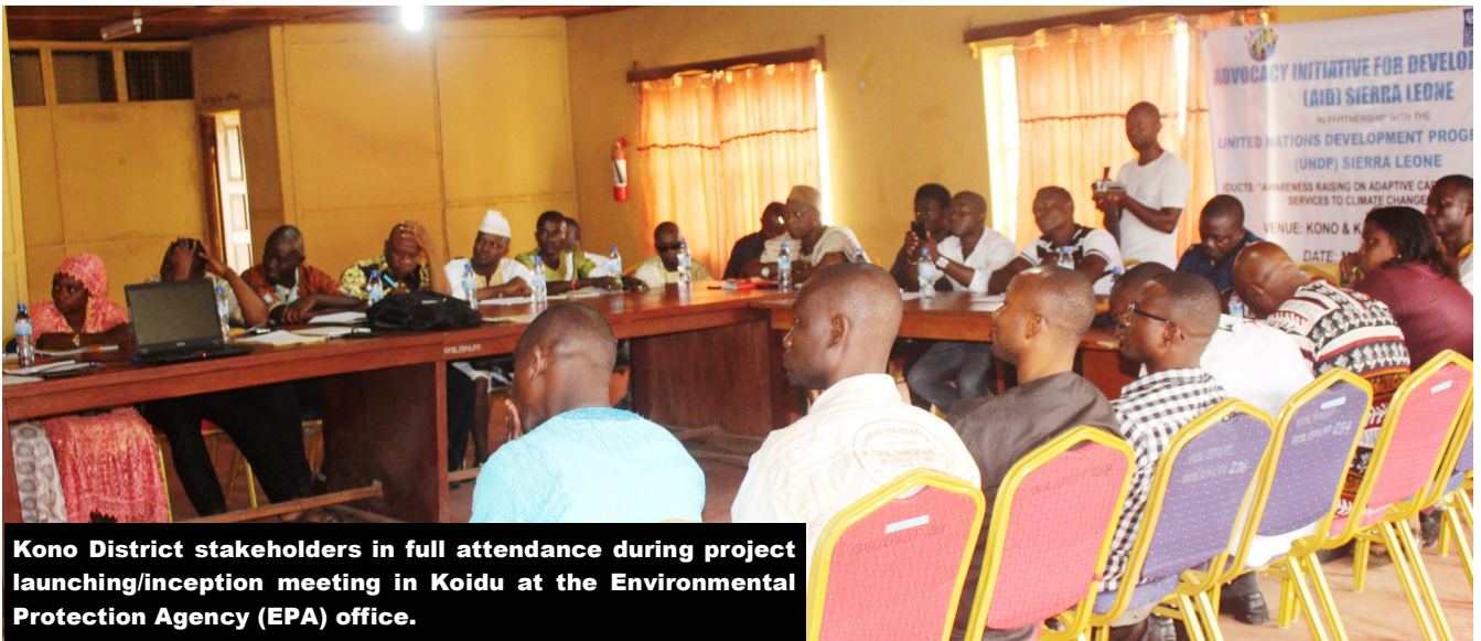
Kono District stakeholders in full attendance during project launching/inception meeting in Koidu at the Environmental Protection Agency (EPA) office.