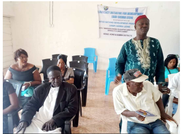
A traditional leader suggesting that government should hands-off timber logging for the sustainable future of their community and environment.