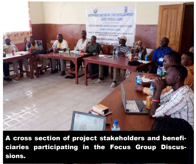
A cross section of project stakeholders and beneficiaries participating in the Focus Group Discussions.