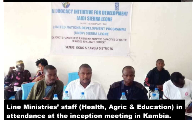
Line Ministries' staff (Health, Agric & Education) in attendance at the inception meeting in Kambia.