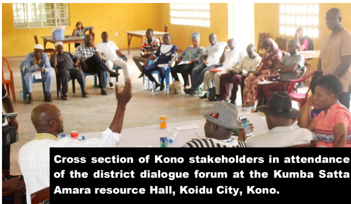
Cross section of Kono stakeholders in attendance of the district dialogue forum at the Kumba Satta Amara resource Hall, Koidu City, Kono.