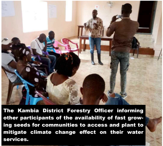
The Kambia District Forestry Officer informing other participants of the availability of fast growing seeds for communities to access and plant to mitigate climate change effect on their water services.