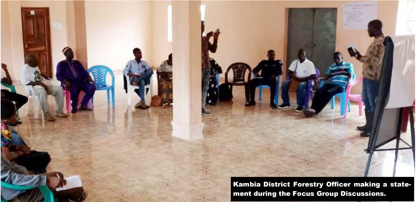
Kambia District Forestry Officer making a statement during the Focus Group Discussions.