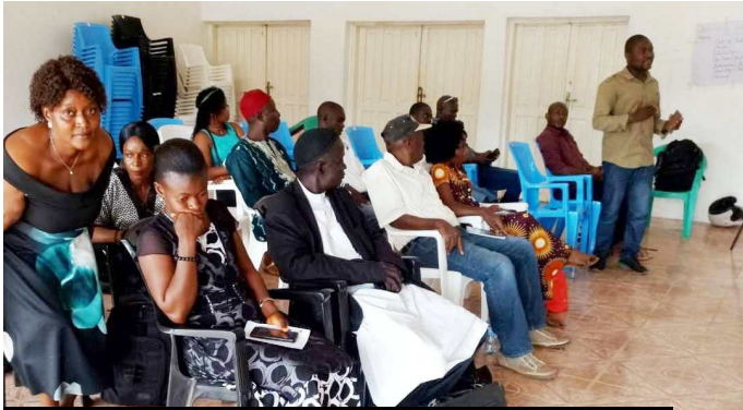
A member of an active WaSH-Net group proposing effective monitoring of the actions agreed upon during the Dialogue Forum