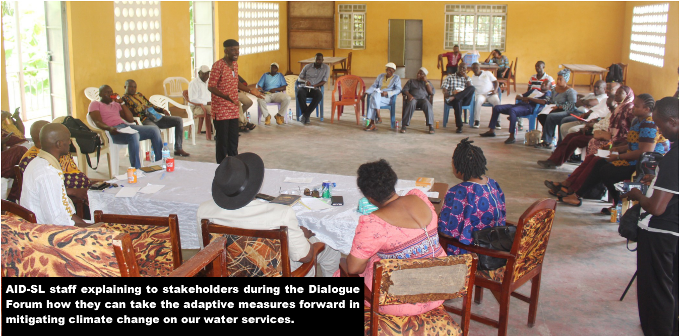
AID-SL staff explaining to stakeholders during the Dialogue Forum how they can take the adaptive measures forward in mitigating climate change on our water services.