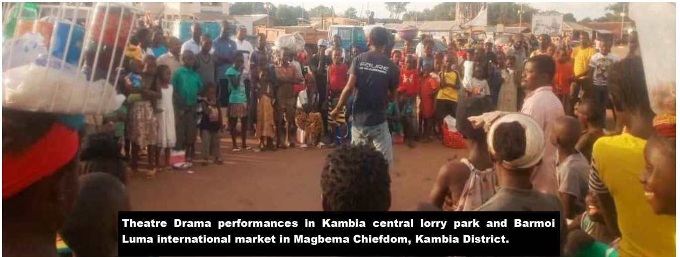
Theatre Drama performances in Kambia central lorry park and Barmoi Luma international market in Magbema Chiefdom, Kambia District.

- Theatre Drama performances in Kambia District -