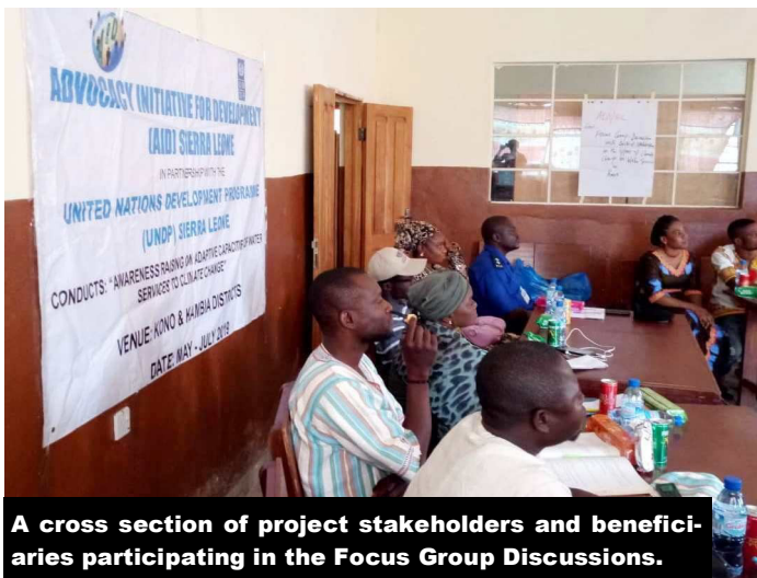
A cross section of project stakeholders and beneficiaries participating in the Focus Group Discussions.