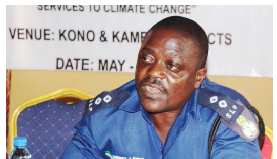
Support Officer at the Tankoro Police Division is with an undivided attention during project inception meeting in Kono. He pledged, on behalf of his Division their support in ensuring that Adoptable measures are monitored and enforced.