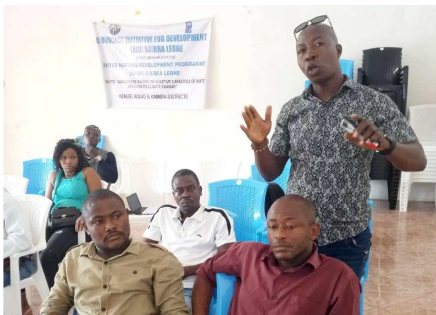
Development Officer, Kambia District Council, explaining how the awareness raising exercise can help mitigate the effect of climate change and their water services.