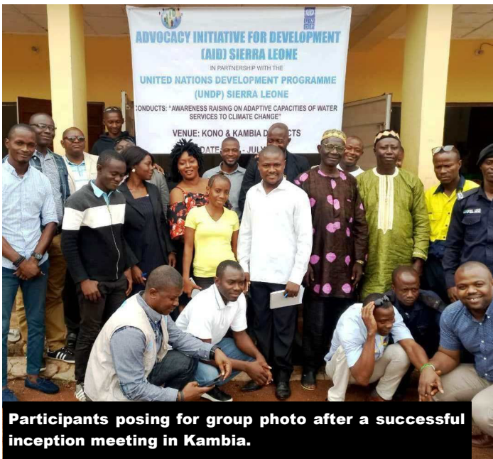
Participants posing for group photo after a successful inception meeting in Kambia.