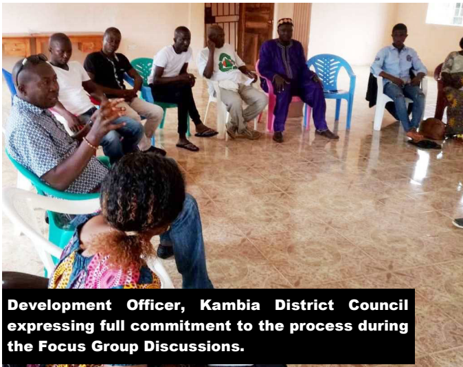
Development Officer, Kambia District Council expressing full commitment to the process during the Focus Group Discussions.