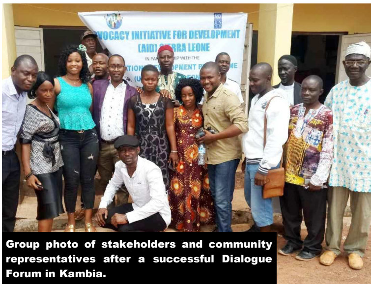
Group photo of stakeholders and community representatives after a successful Dialogue Forum in Kambia.