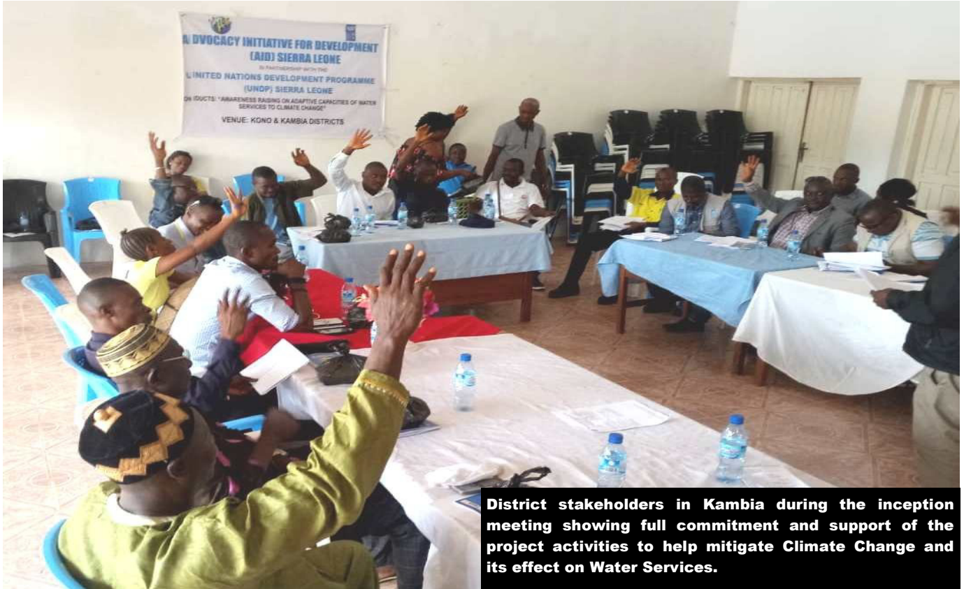
District stakeholders in Kambia during the inception meeting showing full commitment and support of the project activities to help mitigate Climate Change and its effect on Water Services.