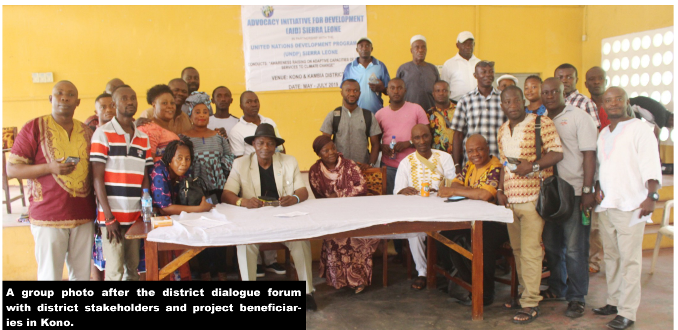
A group photo after the district dialogue forum with district stakeholders and project beneficiaries in Kono.