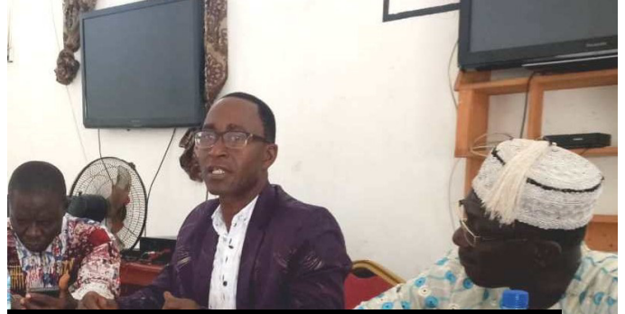
Chairman, Kambia District Council making firm commitment in the Dialogue Forum and promised to include such awareness raising initiative into Council's Development Plans next year.