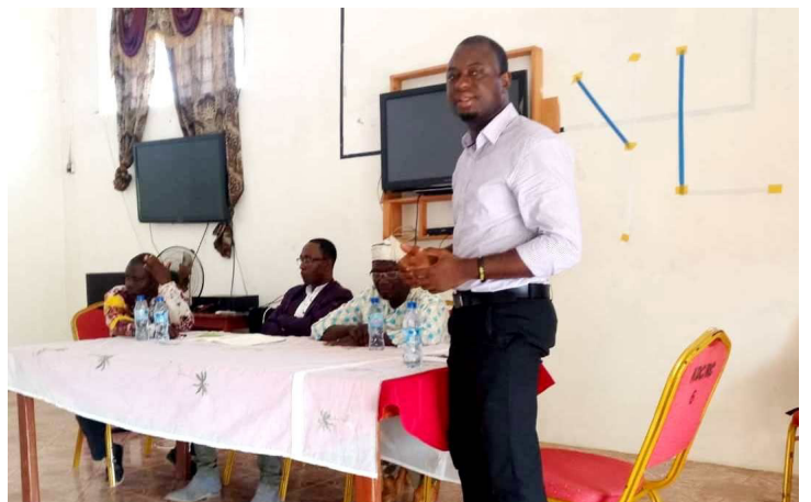
A representative from the Office of National Security (ONS) made a statement on climate change; he confirmed that climate change is real and needed serious attention.