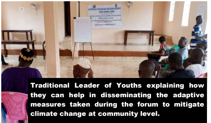
Traditional Leader of Youths explaining how they can help in disseminating the adaptive measures taken during the forum to mitigate climate change at community level.